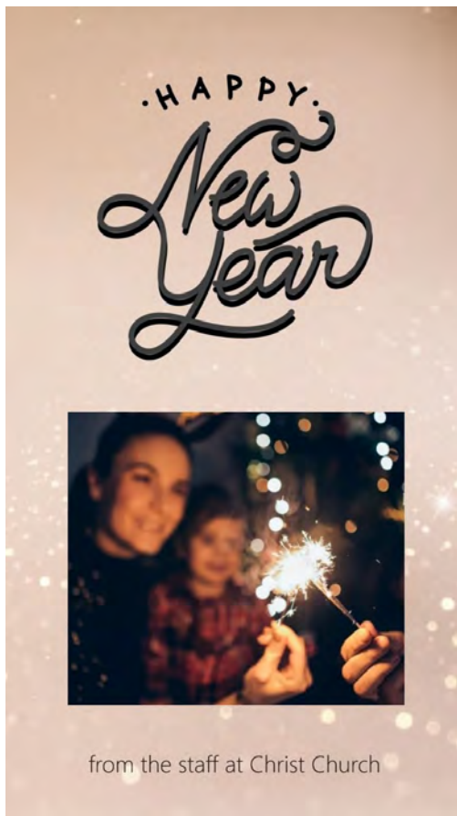
from the staff at Christ Church